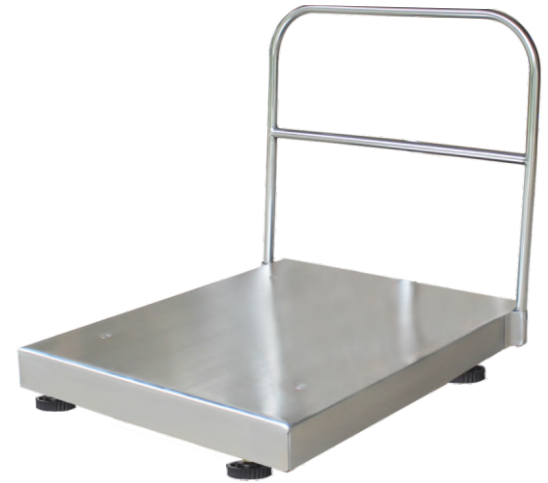
Stainless Steel Platform