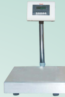
Bench Scale 400 x 400 mm