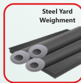
Steel Yard Weighment