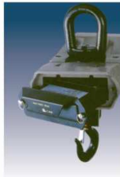
▶ Battery Pack Installation