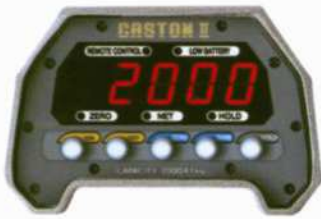
▲ Display & Key Board