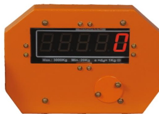
Thermal Scale with cover