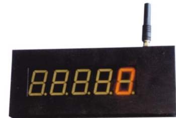
Wireless Remote Display (Option)