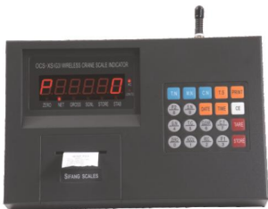
Wireless Remote Indicator with Printer (Option)