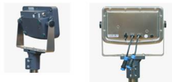
Nebula Indicators with U bend and Pole Mounting Bracket